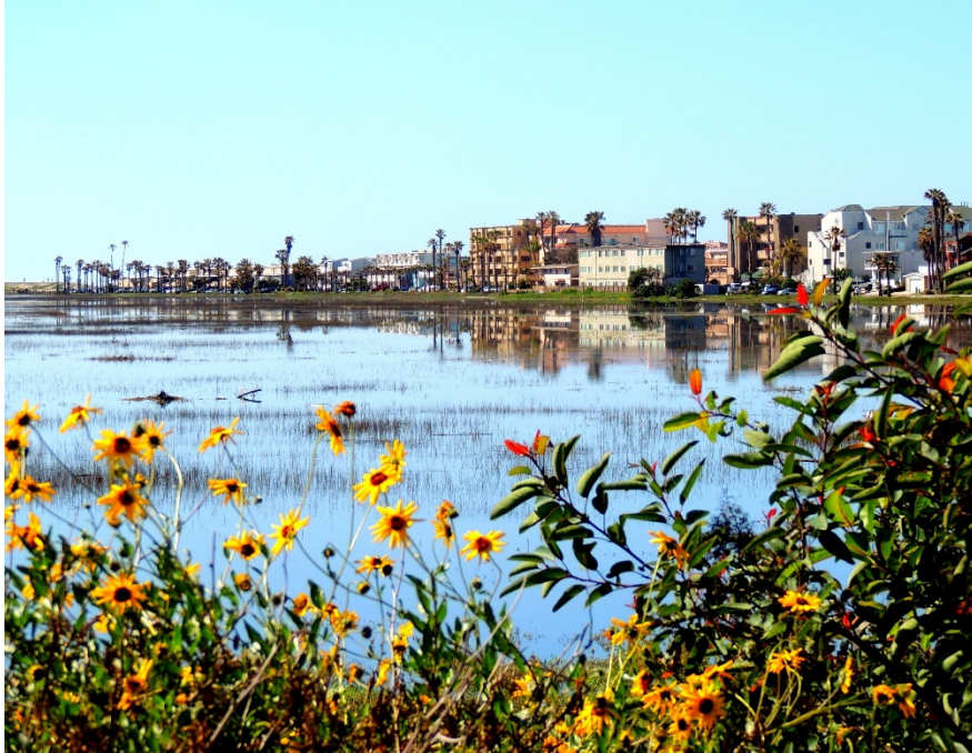
King Tide in California