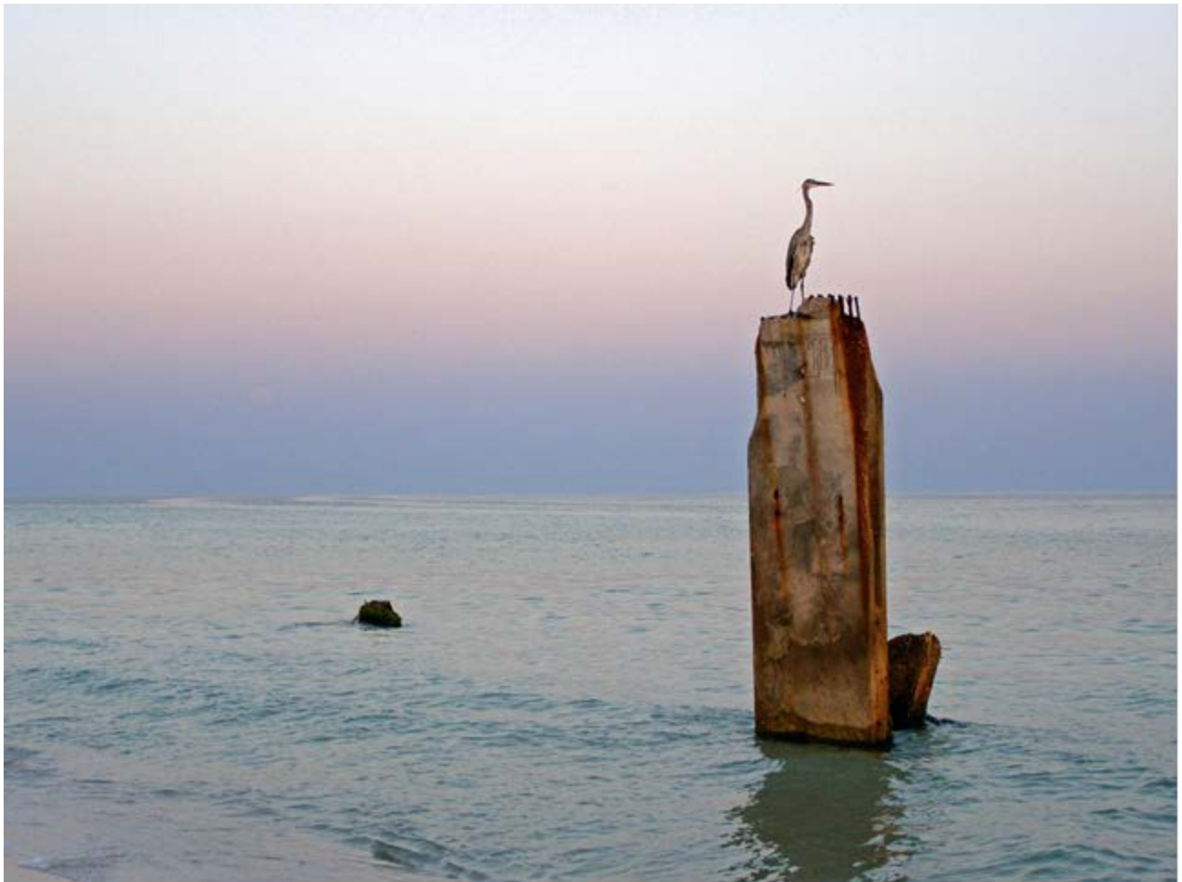
Location: Ft Walton Beach, Florida