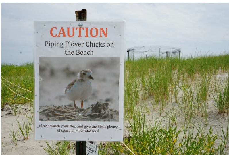
Dune Grass Restoration Project