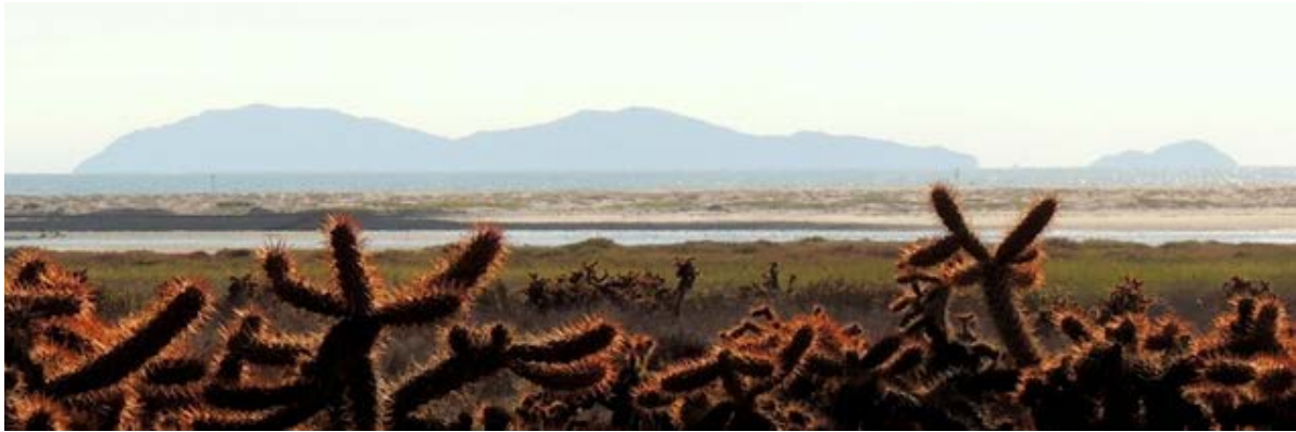
Location: Los Coronados Islands, California