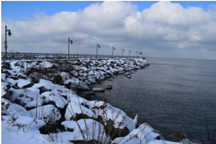
Location: Avon Lake Boat Dock, Lake Erie