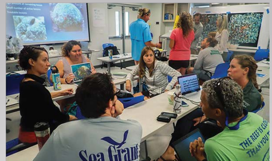
A U.S. VI-FL SCTLD learning exchange to build capacity for SCTLD response.