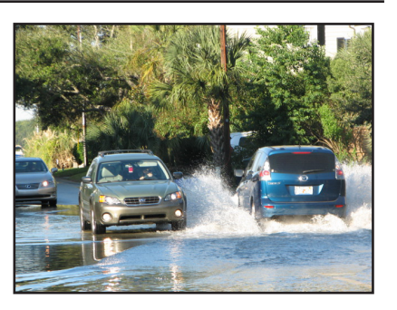
During a tidal flooding event on October 8, 2010, high tide reached 7.66 feet. Wind was from the northeast at less than 10 mph. There was no rain. Had rain accompanied the high tide, flood conditions would have been more extreme.