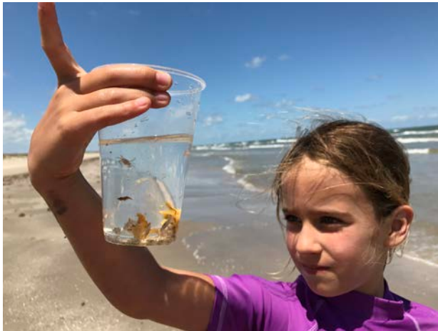
Jace Tunnel. Mission-Aransas Reserve in Texas