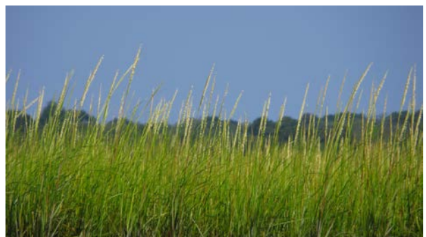
Daisy Durant, Narragansett Bay Reserve in Rhode Island