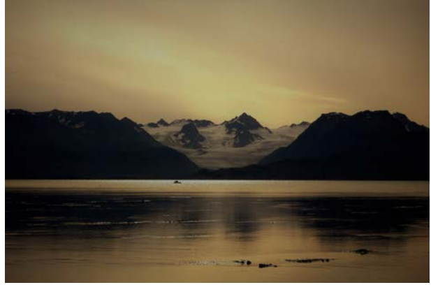
Amy Uhrin, Kachemak Bay Reserve in Alaska