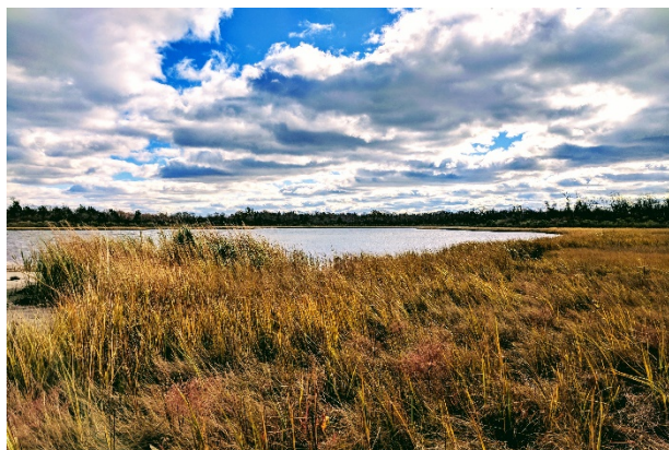
Maureen Dewire, Narragansett Bay Reserve in Rhode Island