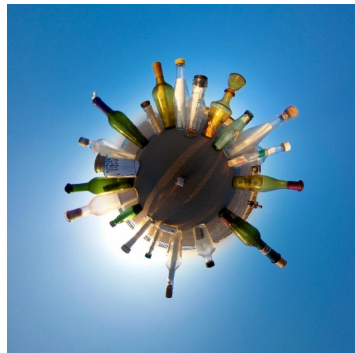
Jace Tunnell, Mission-Aransas Reserve in Texas