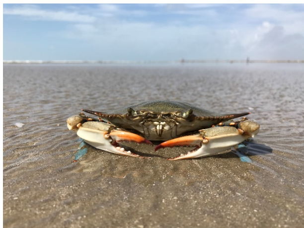
Jace Tunnell, Mission-Aransas Reserve in Texas