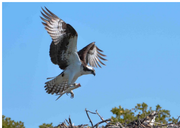
Terry Lumb, Rookery Bay Reserve in Florida