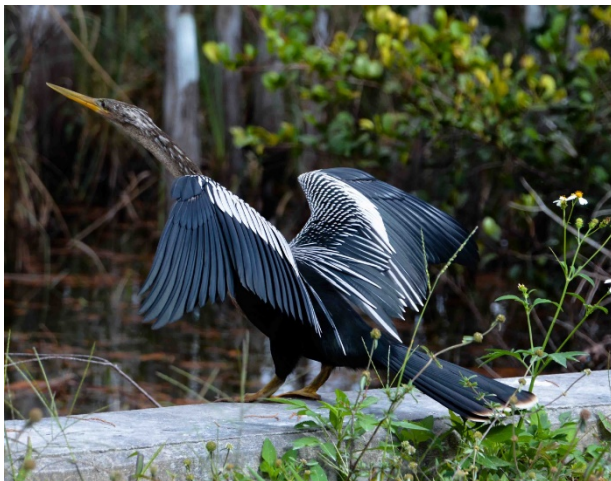
Terry Lumb, Rookery Bay Reserve in Florida