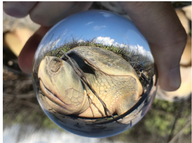
Jace Tunnell, Mission-Aransas Reserve in Texas