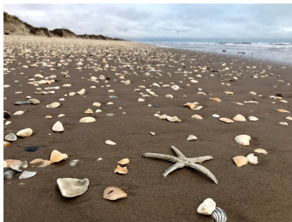
Jace Tunnell, Mission-Aransas Reserve in Texas