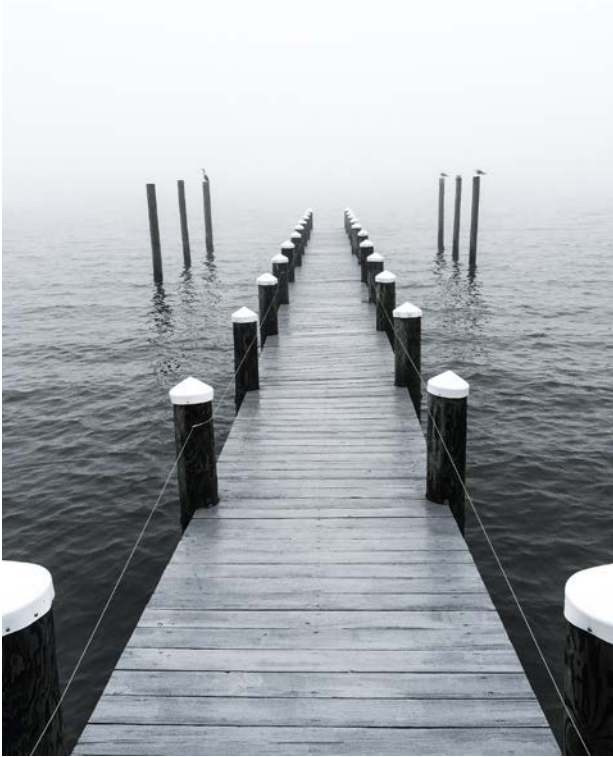
Location: Forked River, New Jersey