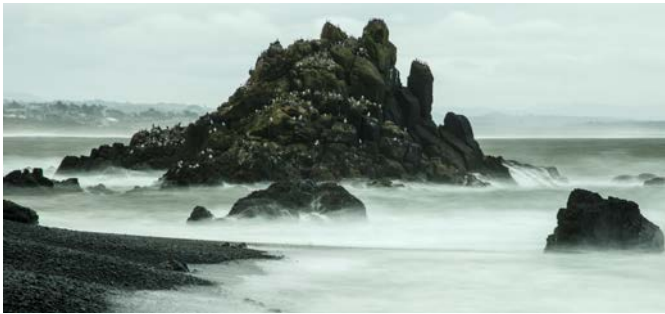
Location: Yaquina Head, Oregon