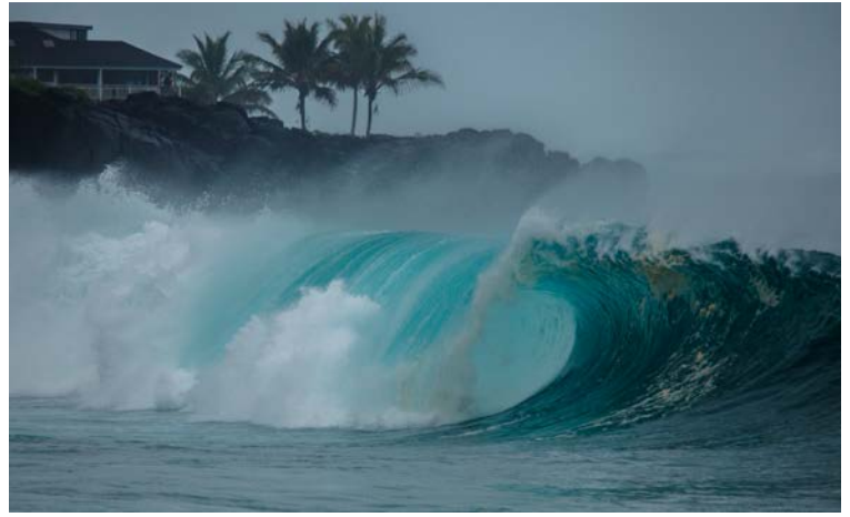
Location: North Shore Oahu, Hawai'i