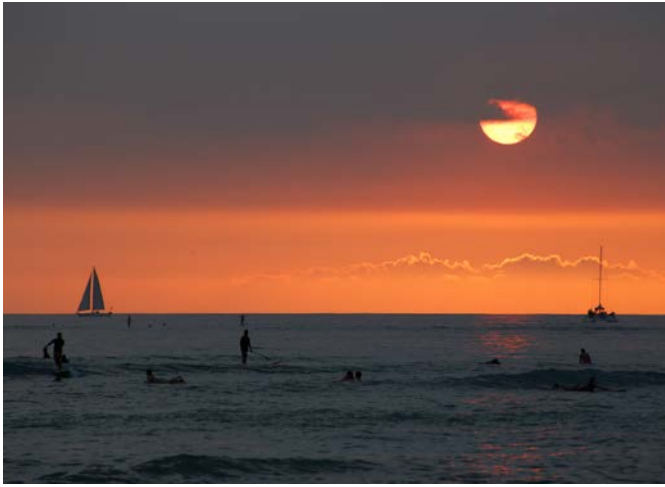
Location: Honolulu, Hawai'i