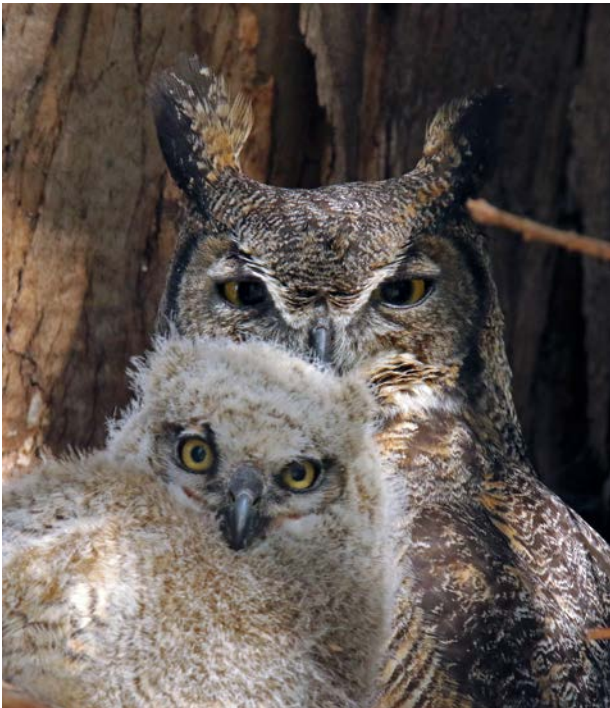
Location: San Francisco Bay National Estuarine Research Reserve