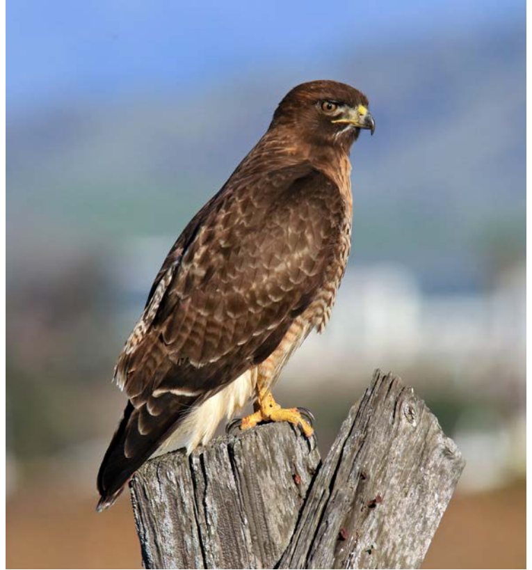
Location: Rush Ranch, San Francisco Bay National Estuarine Research Reserve