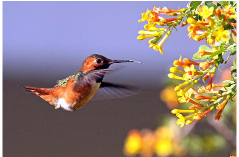
Location: San Francisco Bay National Estuarine Research Reserve